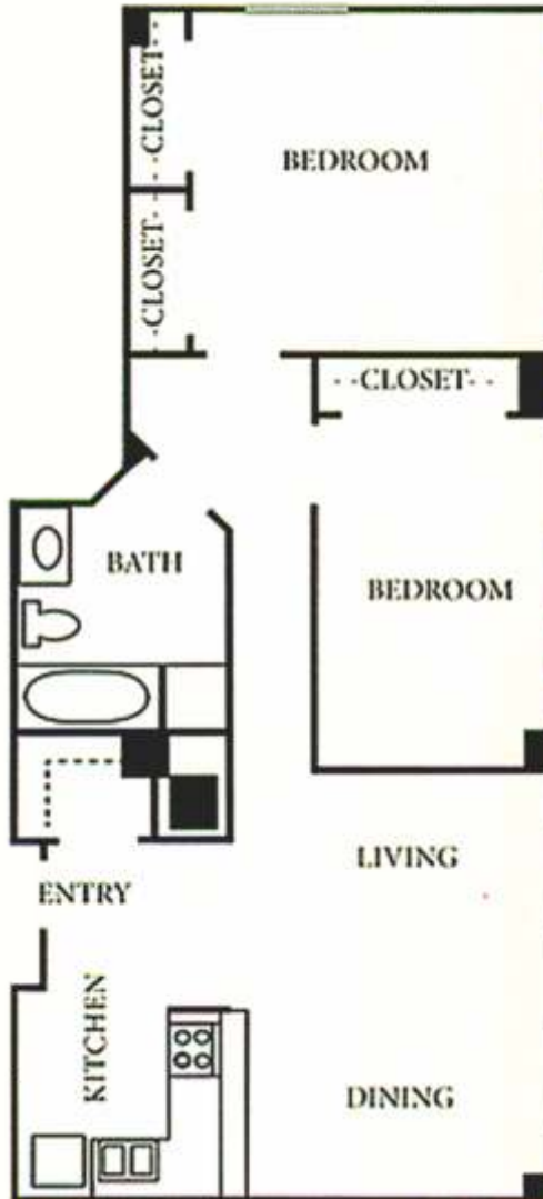
2 Bedroom / 1 Bath 820 Sq. Ft.*