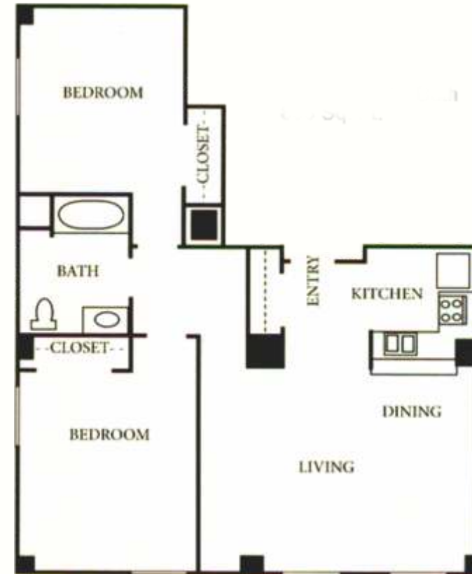
2 Bedroom / 1 Bath 868 Sq. Ft.*